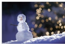
Frosty the Snowman 108x108mm £3.50 pack of 10 cards