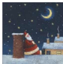
Starlit Night 80x80mm £2 pack of 10 cards