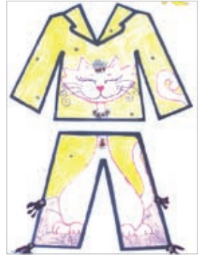
Bridey Irvine - older category