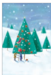
Decorating the Tree 116x160mm £3.75 pack of 10 cards