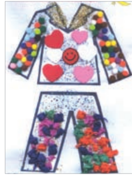
Ella Flanagan - younger category

We particularly liked Ella's use of different textures and colours, and Bridey's cat's sparkly collar and crown! Thank you to everyone who took part!